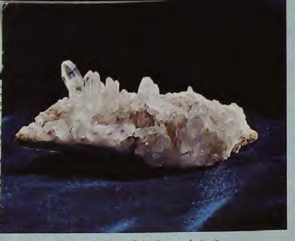
A superb piece of rock crystal, showing to perfection its crystalline structure.