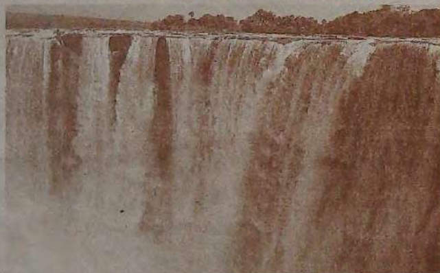
VICTORIA FALLS, RAINBOW FALL.

The advantages of Rhodesia to the man with moderate capital are:—