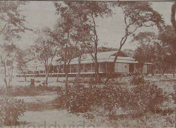
A view of The Victoria Falls Hotel from the pathway to the Falls in 1910

Small Batteries and Mining Materials supplied, or will join in small Propositions. Apply F.P. Argus Office, Capetown