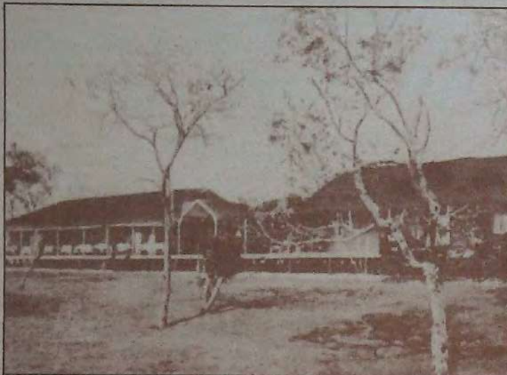
A view of The Victoria Falls Hotel in 1904. The rate was only a guinea a day