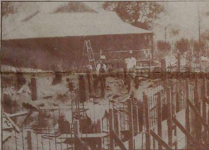
Construction of the Hotel in 1904