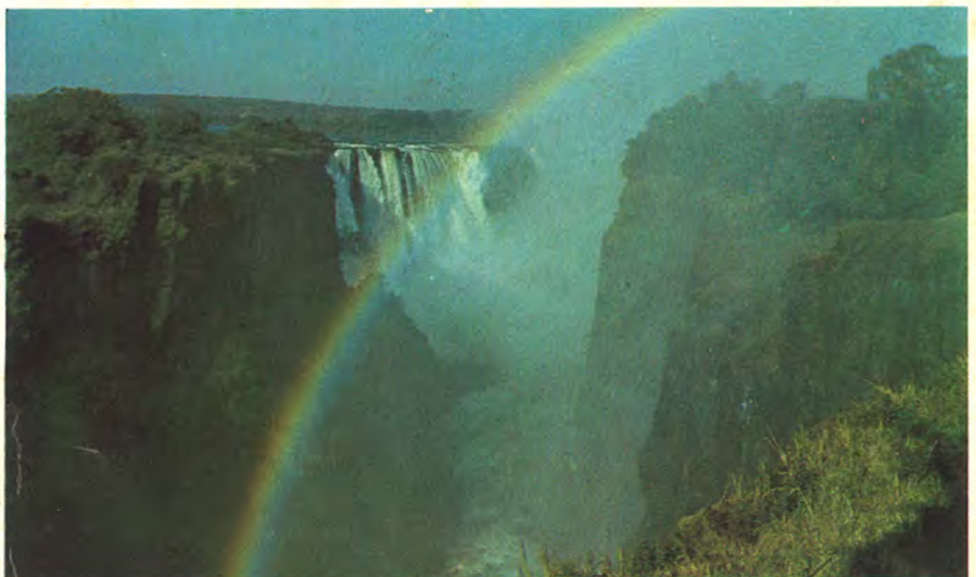
The magnificent, breath-taking Victoria Falls is a key point in tourism in southern Africa. Traffic to it has increased steadily and Rhodesia is taking great care that the natural surroundings of this world beauty spot will be preserved for posterity.