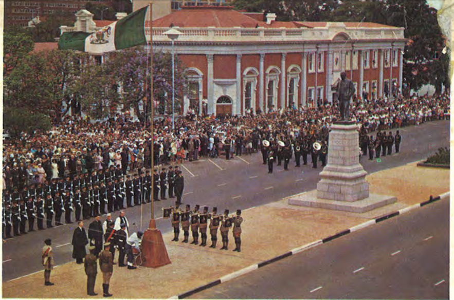
Rhodesia's new green and white flag was raised for the first time at a service on 11th November, 1968, in Salisbury in front of a statue of Cecil John Rhodes, the country's founder. Similar ceremonies were held in all main centres.