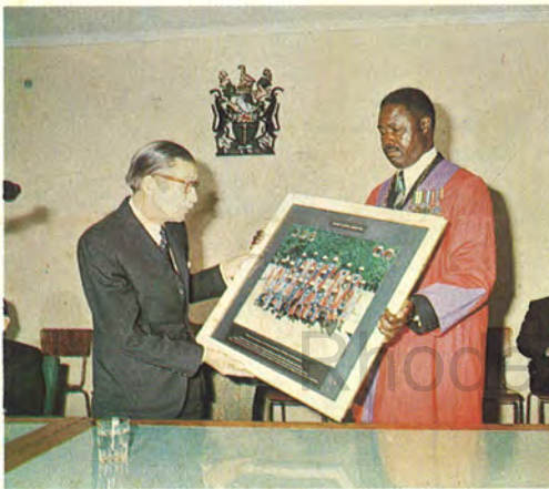
The President, the Hon. Clifford Dupont, who retires this year, is presented with a photograph of the Council of Chiefs by the Council President, Chief Chirau.