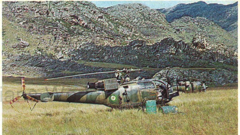
Helicopters of the Air Force refuel after flight training in mountain rescue.