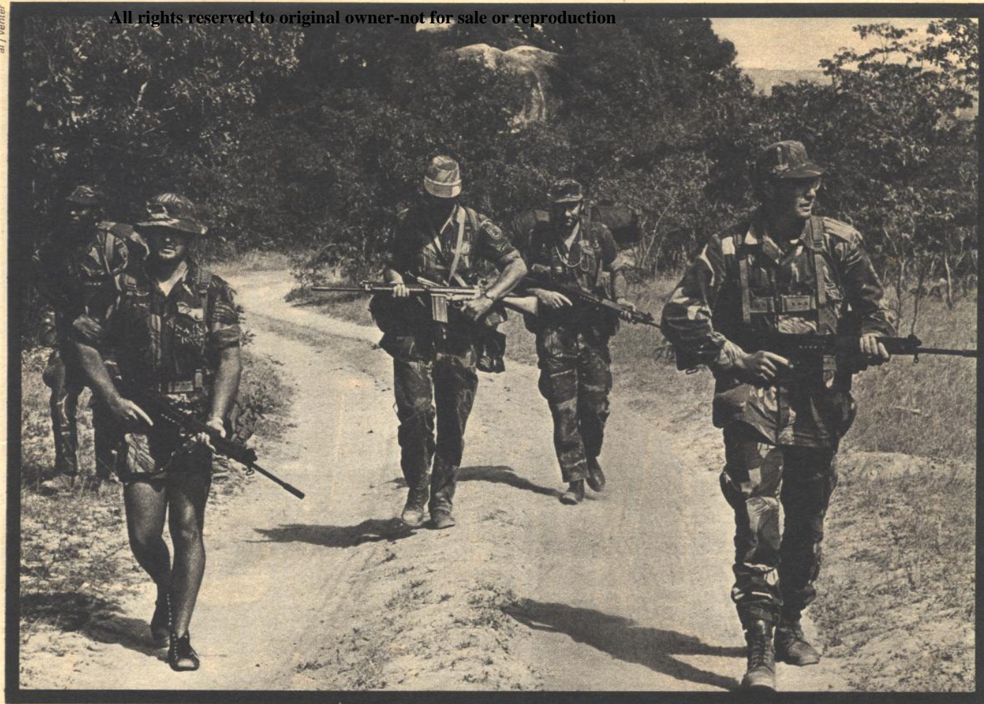
Rhodesian troopers on patrol. Mugabe claims his forces are winning; the Rhodesian authorities say the opposite. Whatever the true facts, there can be no doubt that the Rhodesian soldier is just about the finest fighting man in the world today.