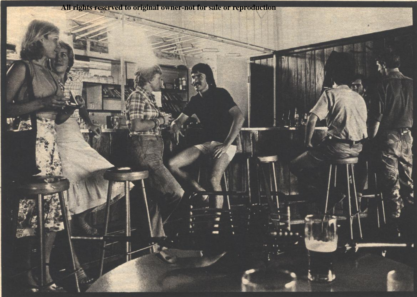
Rhodesians enjoy a sundowner at the Centenary East Country Club. Robert Mugabe says whites will be forced to undergo "psychological reconditioning" if he comes to power.

settlement backed by Muzorewa, Sithole and Chirau. "We will not be a party to any internal agreement. We want genuine independence, not some phoney, neo-colonial stuff," he said.