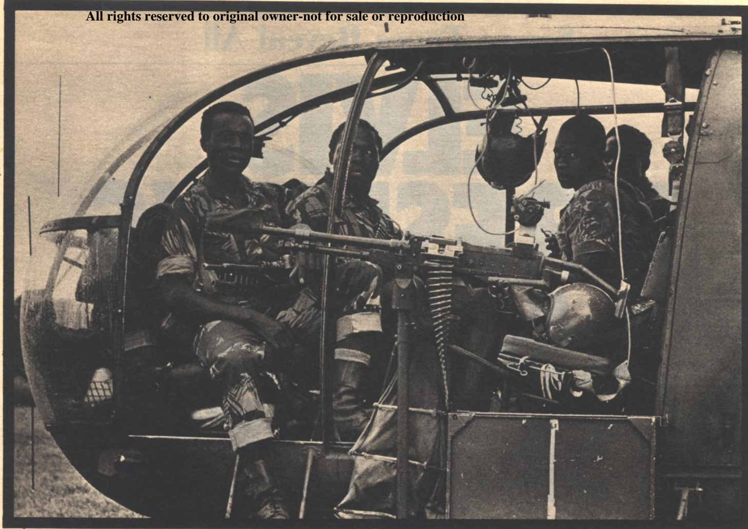
Black Rhodesian soldiers ... what will happen to them if militant Mugabe ever comes to power?

with this cunning trick to make it appear that ZANU forces were responsible."