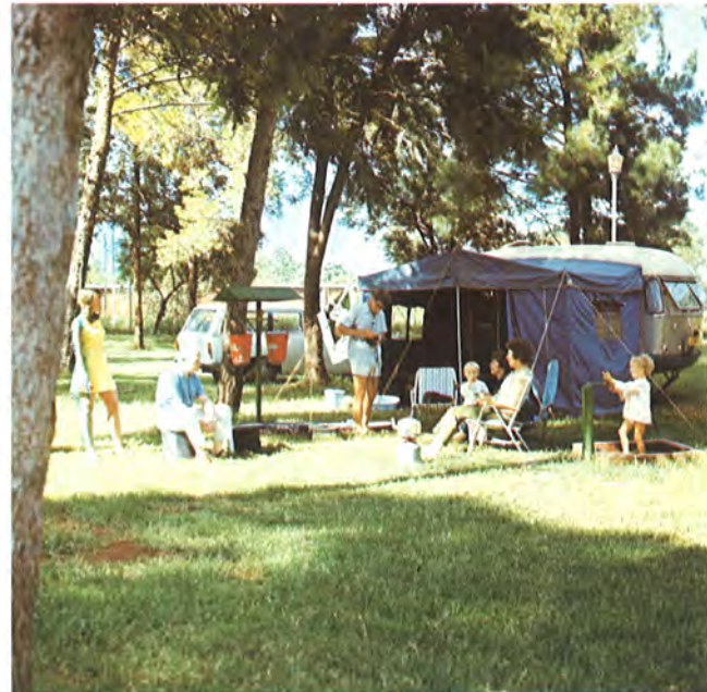
The Municipal Caravan Park, offers all amenities in really beautiful surroundings within walking distance of the city centre. ▲

Caravan Parks and Camping Sites: At Maleme, Toghwana, Mtsheli, Mpopoma Dam and Arboretum. All in beautiful surroundings, and all have ablution blocks and firewood. Drinking water should be boiled.