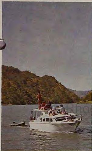
Left: A journey up the winding Sanyati Gorge is most impressive. Fishing here is considered to be excellent.