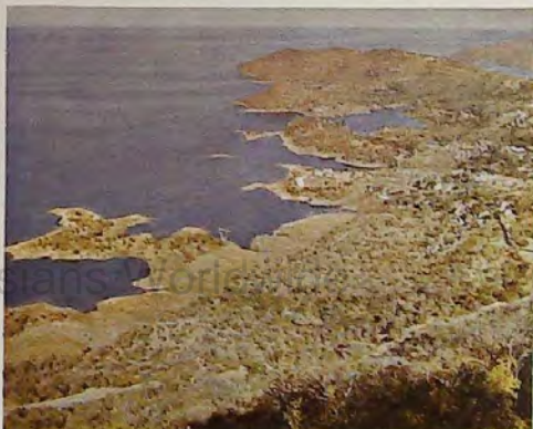
Below: The interesting bays and inlets along the shoreline can be fully appreciated from viewpoints at Kariba Heights.