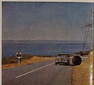
Below: Blue lake, sky and distant mountains are seen from the Lake Drive, which skirts the water's edge near Kariba.