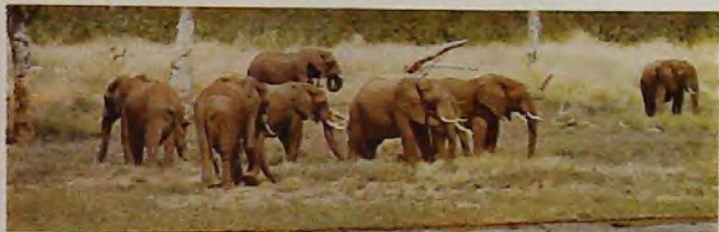
Left: Elephants on the shore at Bumi Hills. The nearby Matusadona Game Reserve has a high population of wild life, much of which can be seen at the water's edge from passing boats.