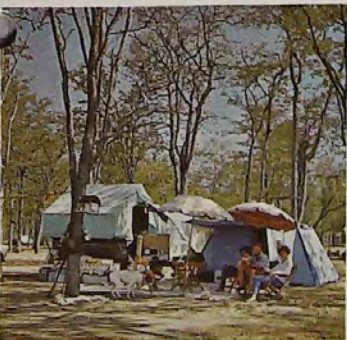
Above: A shady spot to park the caravan and camp at the Mopani Bay site, which is on the lakeshore.