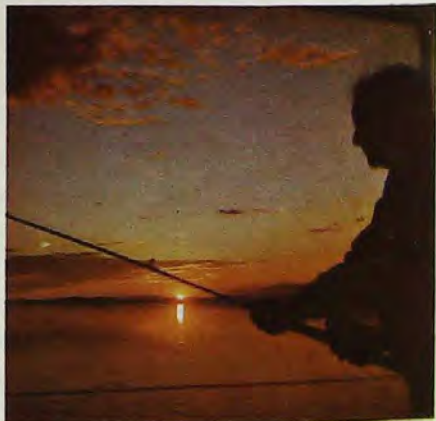
Right: A typical sunset over the lake.