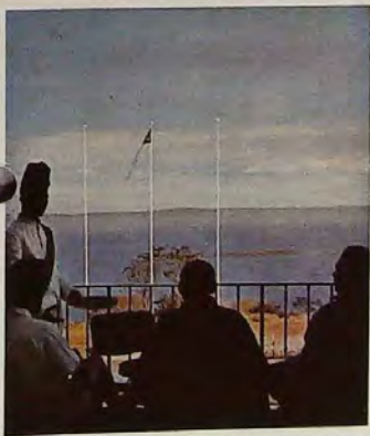
Above: The Kariba Hotel is situated 1,200 feet above the lake, and from its terrace and bedrooms views over hundreds of square miles of lake scenery are obtainable.