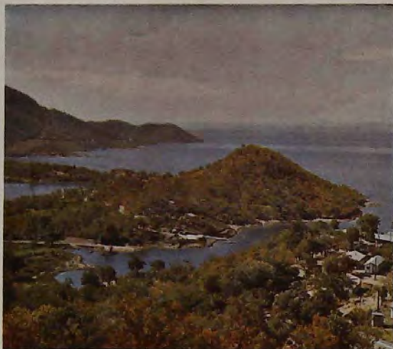
Left: A view from Camp Hill, with Lake View Motel in the foreground and the Kariba Yacht Club in the sheltered bay below.