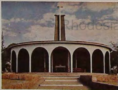
Above: The unique Roman Catholic church of St. Barbara is situated on Kariba Heights and has many features to interest the visitor.