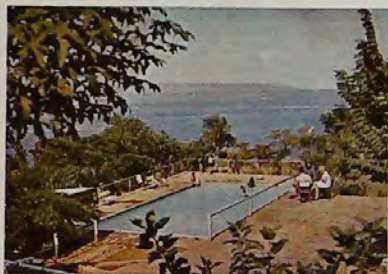
Above: From the gardens of the Cutty Sark Hotel the Matusadona Mountains can be clearly seen. Left: Tuition in the exciting sport of water-skiing is provided at several lakeside establishments. Below: Game-viewing trips are operated daily.